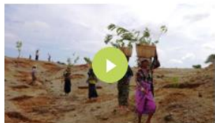
CTCN/GAN webinar: Sustainable Regional Development Model - A community based model for climate change mitigation and adaptation