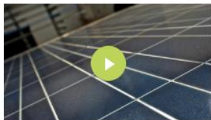
CTCN/AEC webinar: AEC Systems Change Methodology