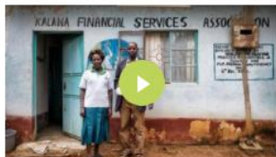
CTCN/Practical Action webinar: Energy access financing