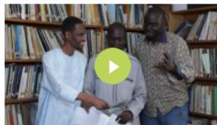
CTCN/GHGMI Webinar: Growing internationally- recognized greenhouse gas professionals in your country