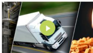
CTCN/INER webinar: Implementation of Energy Efficiency in Ecuador and its impacts